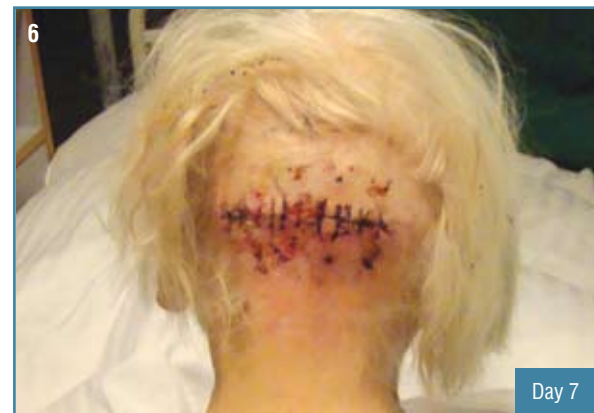
One day after suturing.