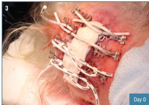
Wound covered with dressing.