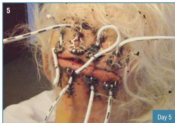
Wound edges approximated. Closure by sutures achieved on day 6.