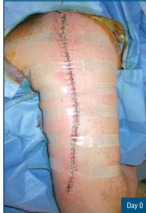
Closed primarily. DynaClose applied to relieve suture tension and prevent dehiscence.