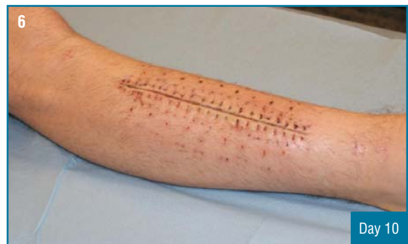
Sutures removed on Day 10.