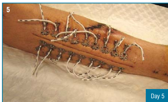
Wound edges approximated. Closure by sutures achieved on Day 5.