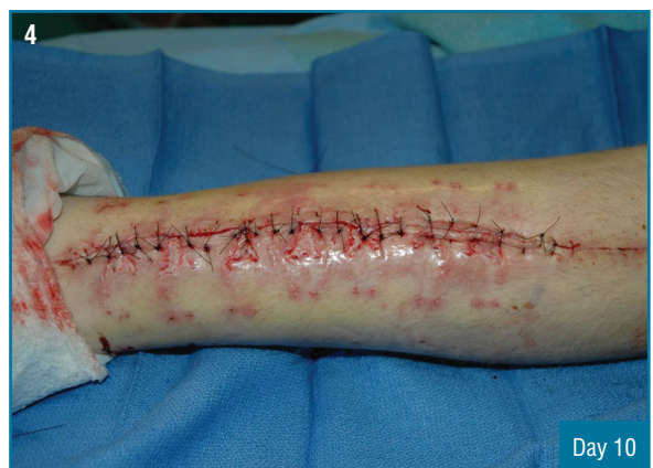
Delayed primary closure.