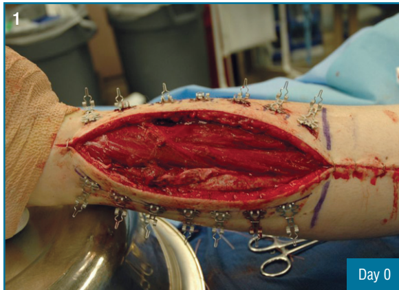
Measuring 30 cm x 7.5 cm, six days post bilateral fasciotomy.

A twenty-year-old man involved in a motor vehicle accident, suffered an extremity compartment syndrome which required a bilateral fasciotomy on the left leg. Six days later, the ABRA Surgical Skin Closure System was applied on the lateral incision while the surgeon closed the medial side primarily. The patient was returned to the operating room ten days later where the system was removed and the lateral side was primarily closed.